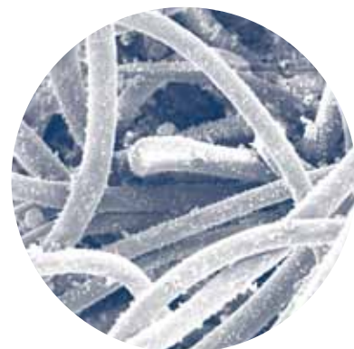
Polyester Bag–Clean Air Side (300x)